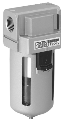
SA206F & SA206FAD