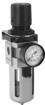
SA206FR & SA206FRAD