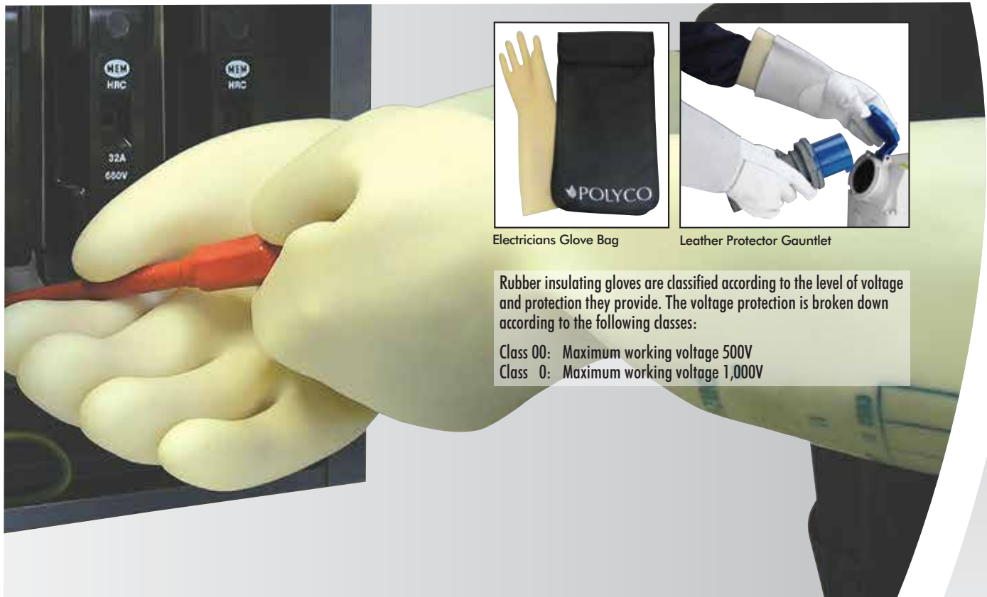
Electricians Glove Bag

Polyco's Electricians Gloves™ offer the highest level of electrical protection available, certified to EN60903. Every pair is electrically tested and has to pass the requirements of the standard prior to release for sale. No gloves of classes 1, 2, 3 and 4 electricians gauntlets, not even those held in storage, should be used unless they have been tested within a maximum period of six months. The tests include air inflation to check for air leaks, a visual inspection while pressurized and a routine dielectric test in accordance with the European standard EN60903. For classes 00 and 0, a check for air leaks and a visual inspection may be considered adequate, however a routine dielectric test may be performed at the owner's request. They are anatomically shaped, flexible and durable offering maximum comfort and superior performance. Polyco's Leather Protection Gauntlet™ can be worn over the top to provide mechanical protection.