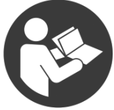
Refer to Instruction Manual

IMPORTANT: PLEASE READ THESE INSTRUCTIONS CAREFULLY. NOTE THE SAFE OPERATIONAL REQUIREMENTS, WARNINGS & CAUTIONS. USE THE PRODUCT CORRECTLY AND WITH CARE FOR THE PURPOSE FOR WHICH IT IS INTENDED. FAILURE TO DO SO MAY CAUSE DAMAGE AND/OR PERSONAL INJURY AND WILL INVALIDATE THE WARRANTY. KEEP THESE INSTRUCTIONS SAFE FOR FUTURE USE.