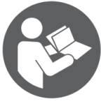
Refer to instructions

IMPORTANT: PLEASE READ THESE INSTRUCTIONS CAREFULLY. NOTE THE SAFE OPERATIONAL REQUIREMENTS, WARNINGS & CAUTIONS. USE THE PRODUCT CORRECTLY AND WITH CARE FOR THE PURPOSE FOR WHICH IT IS INTENDED. FAILURE TO DO SO MAY CAUSE DAMAGE AND/OR PERSONAL INJURY AND WILL INVALIDATE THE WARRANTY. KEEP THESE INSTRUCTIONS SAFE FOR FUTURE USE.